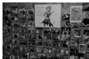
Photos of tourists all over the wall of front office