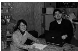
You can ask the staff for advice of sightseeing. English? ..... OK!!

Inquiries: Yokohama Hostel Village, Tel: 663-3696