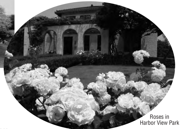
Roses in Harbor View Park