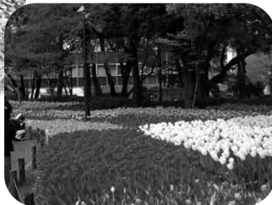
Tulips in Yokohama Park