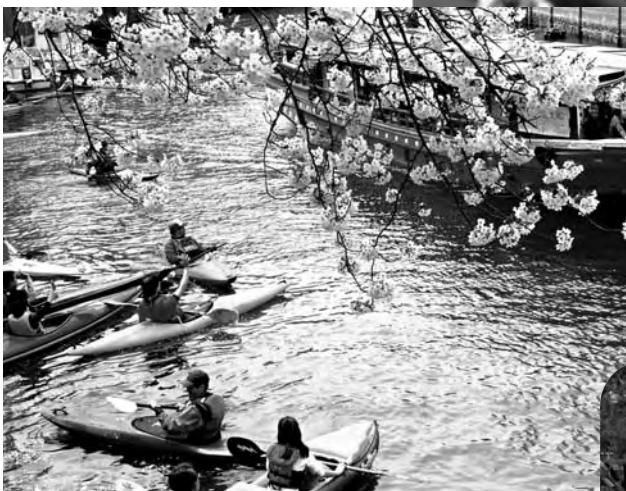
Cherry blossoms at Ookagawa Riverside

There are about 800 cherry trees along the banks of Ookagawa River. Hinodecho Sta. or Koganecho Sta.