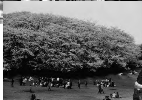
Cherry blossoms in Negishi Shinrin Park