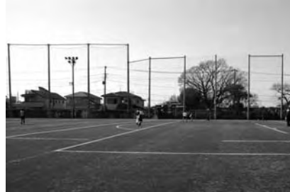
the artificial grass ground of YC & AC, certified by FIFA